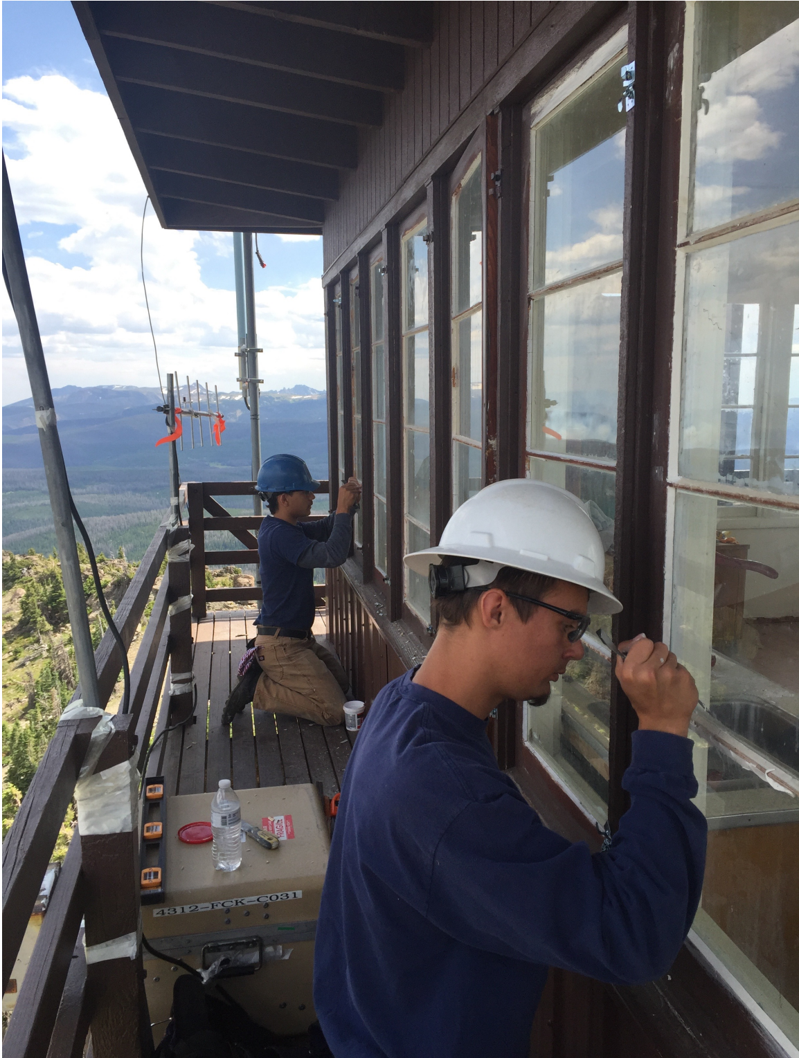
Collbran Job Corps Center workers helping Historicorps